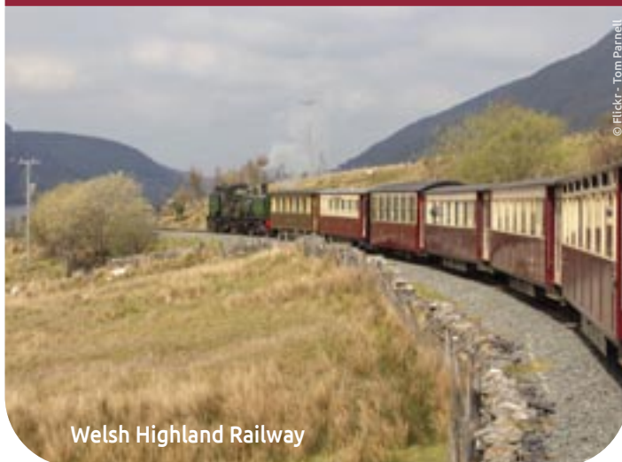
Welsh Highland Railway

Enjoy memorable journeys on the Welsh Highland and Ffestiniog Railways through Snowdonia's stunning scenery.