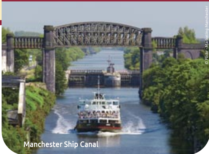
Manchester Ship Canal

Experience Liverpool's glorious maritime history, magnificent architecture and a memorable cruise on the Manchester Ship Canal.