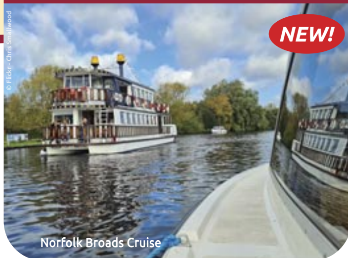
Norfolk Broads Cruise

Explore Norfolk's premier beach resort, wonderful coastlines, a historic medieval city and enjoy a relaxing Broads cruise.