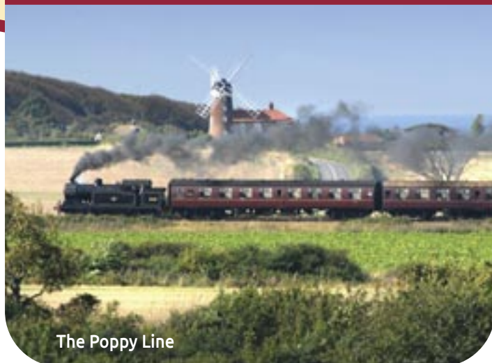
The Poppy Line

What better way to experience Norfolk than with a Broads cruise, a nostalgic railway and a stately home.