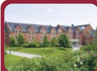
Delta by Marriott Cheltenham Chase ★★★★

Situated at the foot of the Cotswold Hills, this stylish and contemporary hotel has an indoor swimming pool.