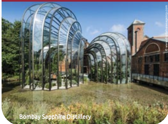
Bombay Sapphire Distillery

Experience historic Hampshire, a nostalgic railway, Jane Austen heritage, an iconic gin distillery & the New Forest.