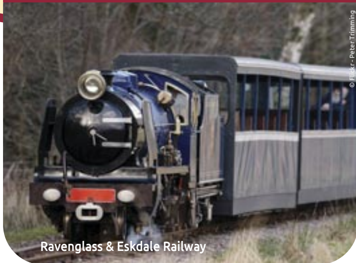
Ravenglass & Eskdale Railway

Be inspired by the Lake District's famous breath taking scenery, nostalgic steam train journeys and relaxing lake cruises.