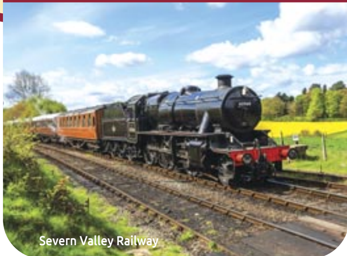
Severn Valley Railway

Visit Shropshire, with its remarkable heritage, a memorable train journey, the gourmet town of Ludlow and a lovely river cruise.