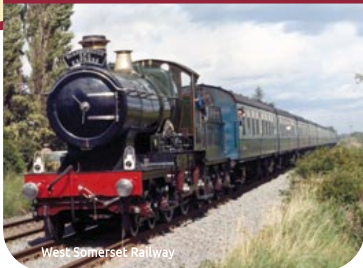
West Somerset Railway

Visit two of the most beautiful and scenic counties in Britain, whilst relaxing on cruises and a steam train journey.