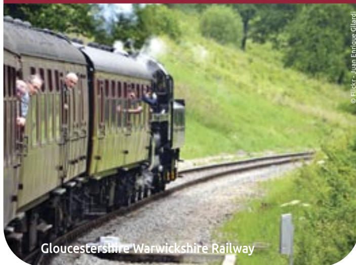
Gloucestershire Warwickshire Railway

Explore Regency Cheltenham, medieval Tewkesbury, a heritage railway journey and the charming Cotswolds towns and villages.