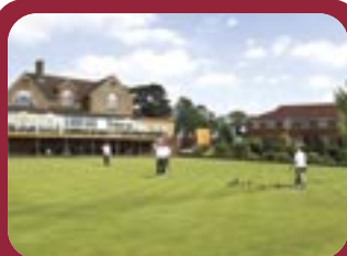
Bells Hotel & Country Club ★★★

Please see page 48 for a Turkey & Tinsel tour at this hotel.