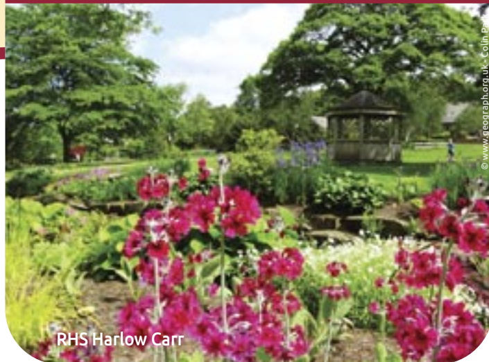
RHS Harlow Carr