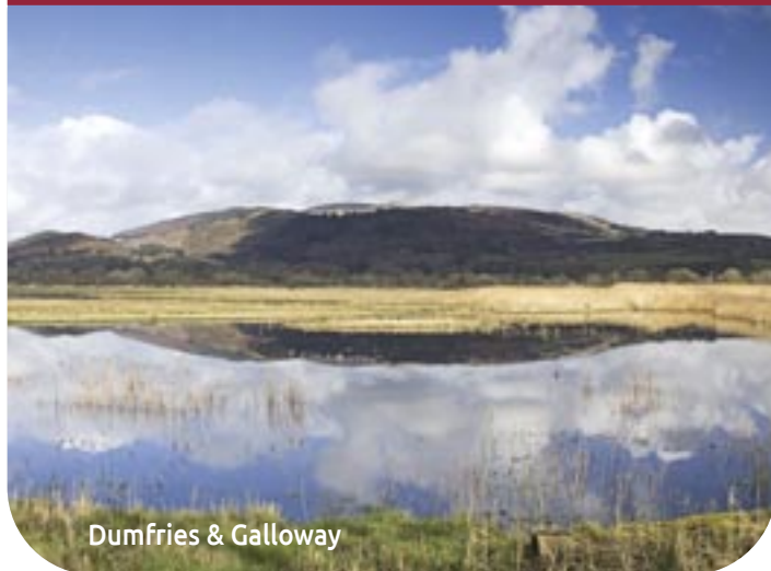
Dumfries & Galloway

Explore this often overlooked corner of Scotland, with its rugged coastline, tranquil lochs, picturesque harbours, beautiful gardens and stately homes.