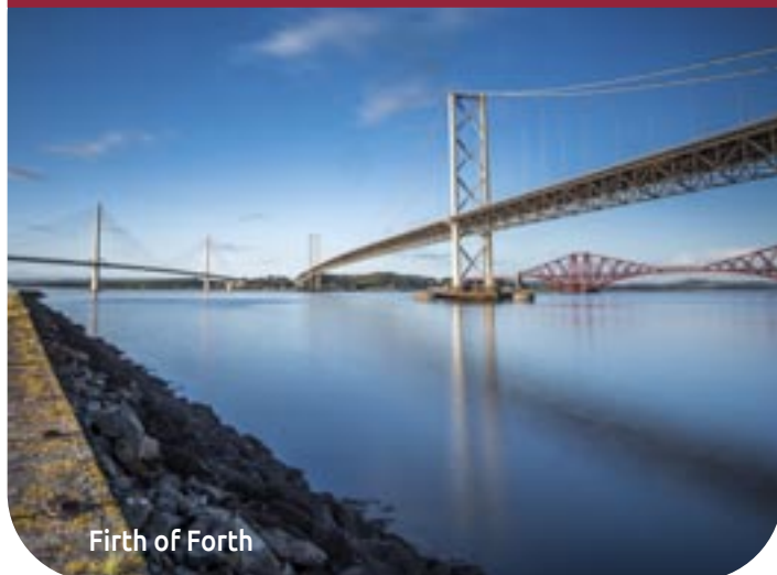
Firth of Forth

Experience a nostalgic rail journey, a Firth of Forth boat trip, the unique Falkirk Wheel and the inspiring city of Edinburgh.