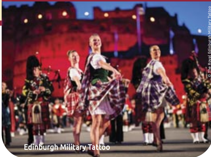
Edinburgh Military Tattoo

Experience one of the world's most spectacular shows, the Edinburgh Tattoo, which is staged at the awe-inspiring Edinburgh Castle.