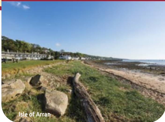
Isle of Arran

Visit Arran - 'Scotland in Miniature', which is one of Scotland's most beautiful islands, and the wonderful Ayrshire Coast.