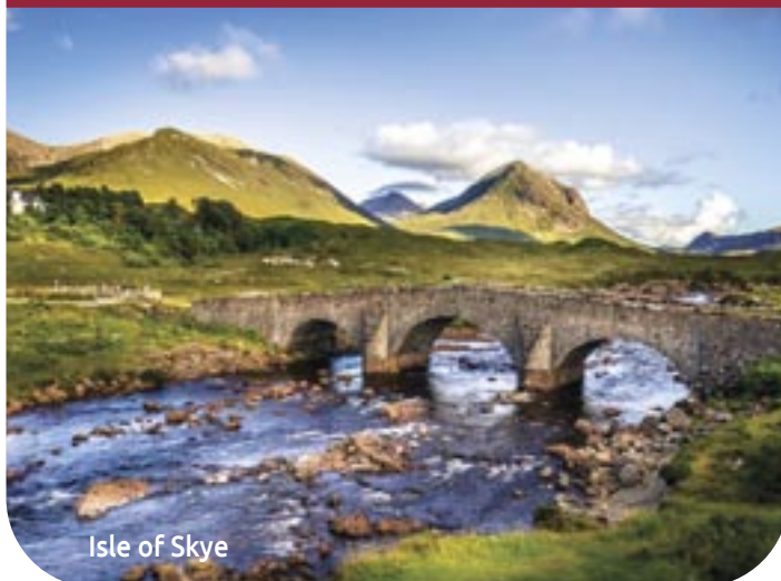
Isle of Skye

Enjoy some of the most spectacular coastal scenery imaginable on the Hebridean islands of Lewis and Skye and their unique heritage.