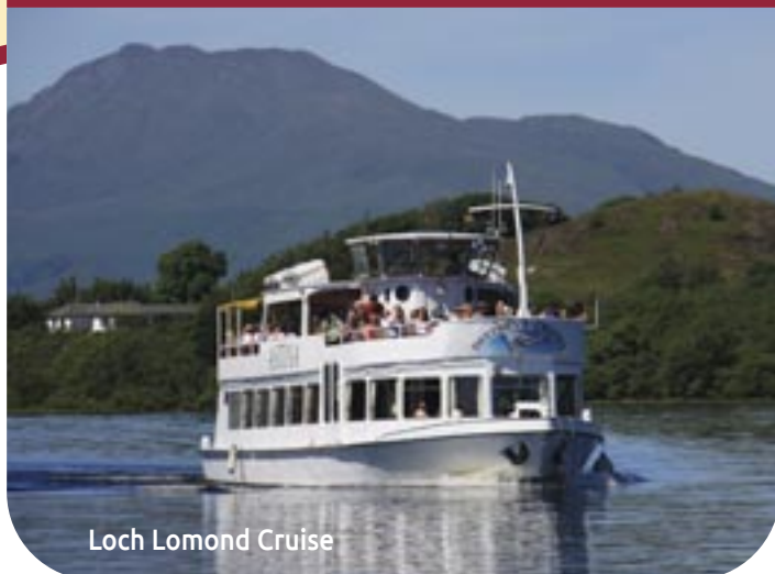
Loch Lomond Cruise

Be inspired, discover breathtaking views, relax on loch cruises and enjoy wee drams, in the Loch Lomond & Trossachs National Park.