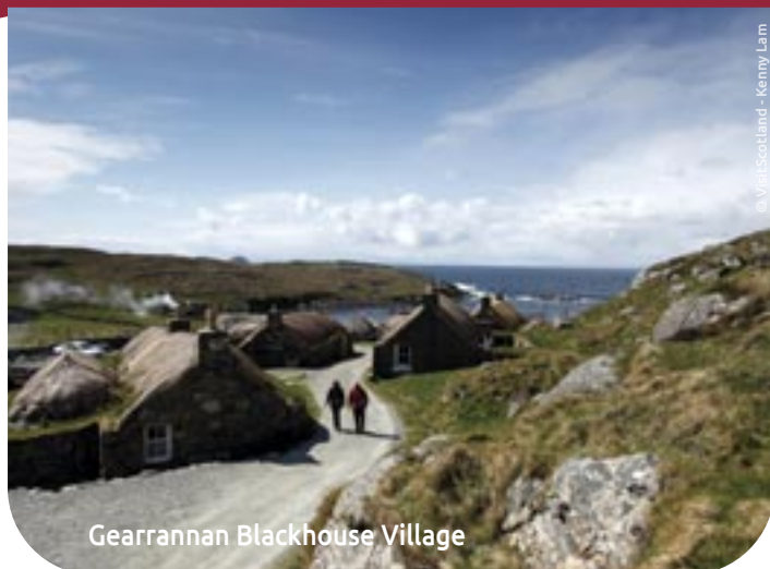
Gearrannan Blackhouse Village