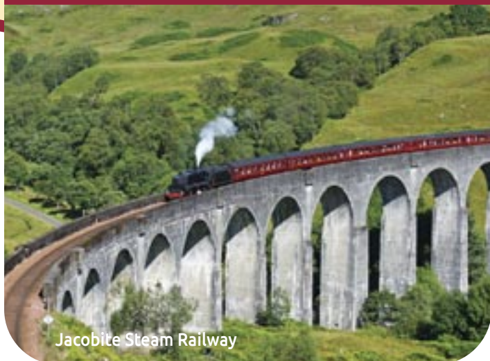
Jacobite Steam Railway

Spectacular Highland scenery awaits on one of the world's most famous rail journeys and along the most infamous of Lochs.