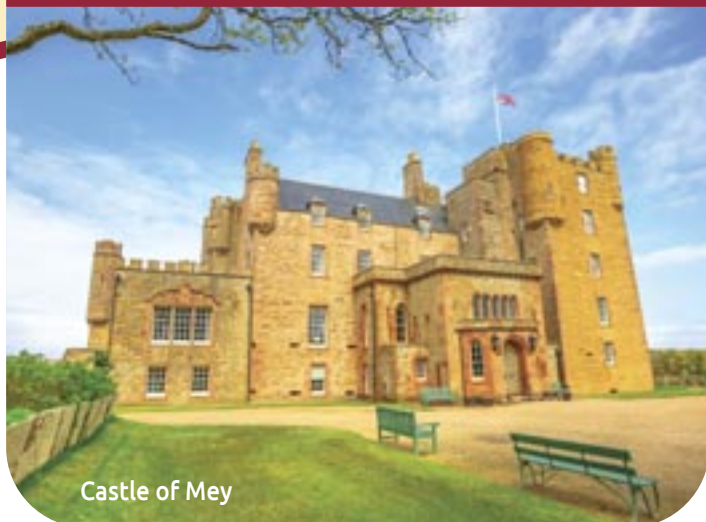
Castle of Mey

Discover the hidden gems of this magical and mystical region, with awe-inspiring visits to Orkney and the Castle of Mey.